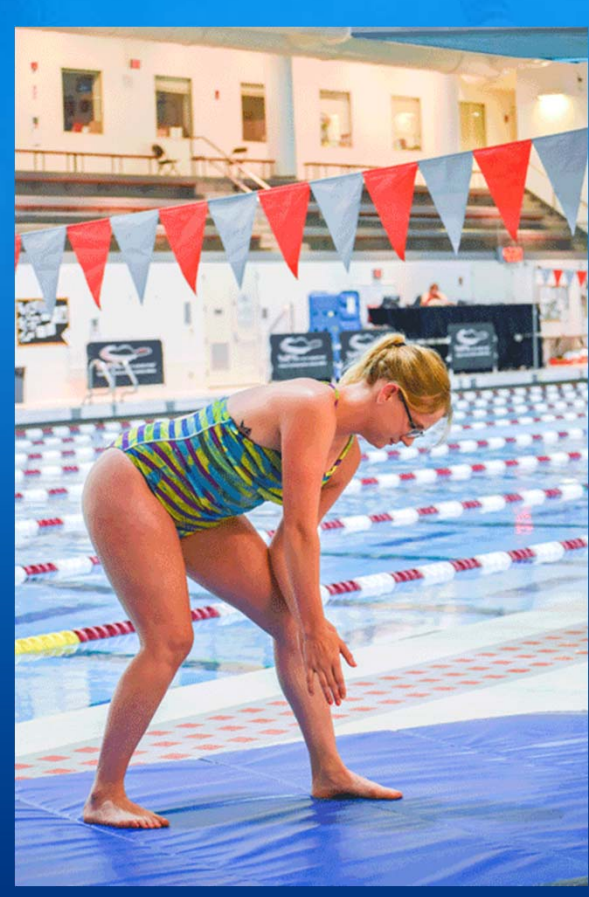
Arm Swim & Arm Rotations