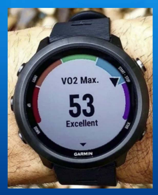
V02Max result on a Garmin SmartWatch

For outside the water, a land-based treadmill is often used to record treadmill V02max, although statistics show that a swimming V02max test can be somewhat difficult to conduct, it often has better results for swimming.