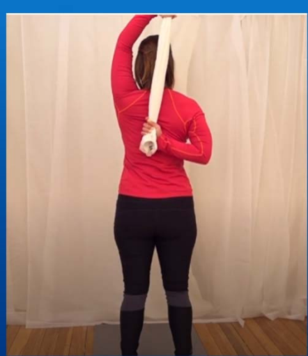
Towel Stretch https://www.spine-health.com

Repeat a few times. You should feel a stretch across the front of your chest.