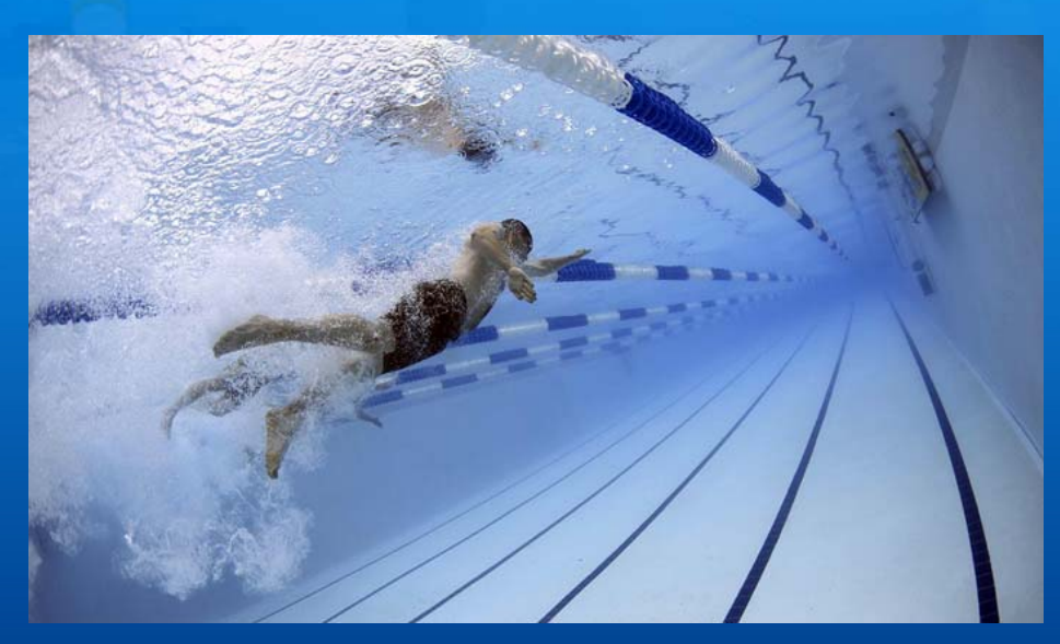
Swimming Beep Test - When the swimmer swims lengths, the beep goes off.

The swimmer's score is then recorded and the number of laps is recorded. All ages of swimmers can use this test, which tests aerobic fitness levels. One disadvantage, however, is practice and motivational levels can influence the score.